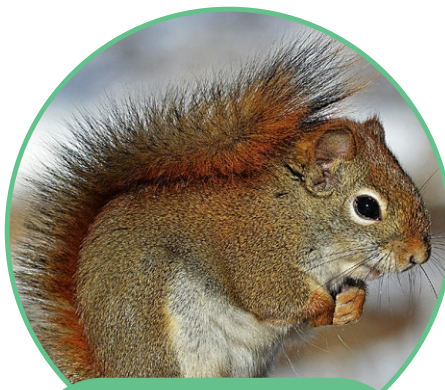
a red squirrel